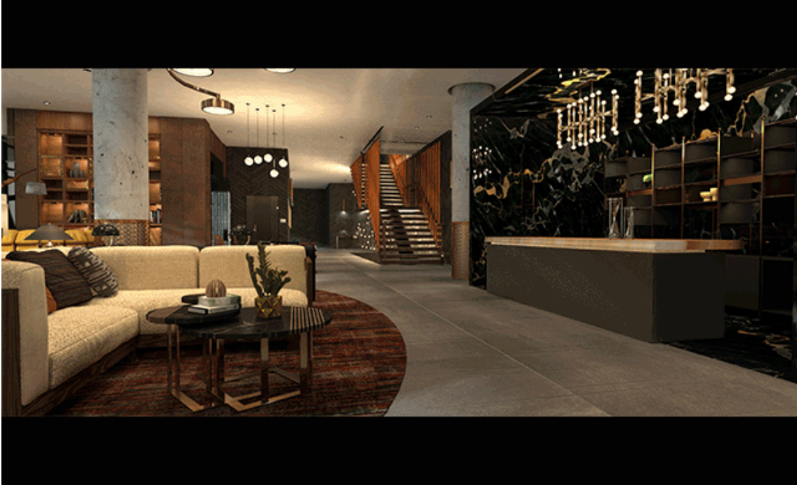
The Thompson San Antonio

elements that highlight original details, including white marble from Marathon, Greece and solar gray glass. Artwork will be featured in the public spaces. Two 1,800-square-foot Thompson Suites will be located on 49th floor, adjacent to the signature supper club-like lounge. The 50th floor will feature a panoramic rooftop observation deck, while the ninth floor will be home to the spa and wellness deck complete with five treatment rooms, a 21,000-square-foot fitness center, and an outdoor infinity pool. A 4,000-square-foot ballroom will open along with additional onsite bars and restaurants.